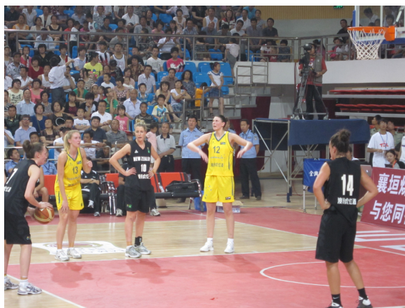
Pictured: Free throw against Australia at the 2011 China Tour