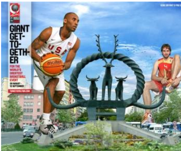
Above: Kobe Bryant (USA) and Pau Gasol (Spain)

With less than 150 days to go to excitement towards the FIBA 2010 World Championship is growing. FIBA has recently launched their 'Giant Get-Together' World Championship promotional campaign and they have also launched the new version of the www.turkey2010.fiba.com website.