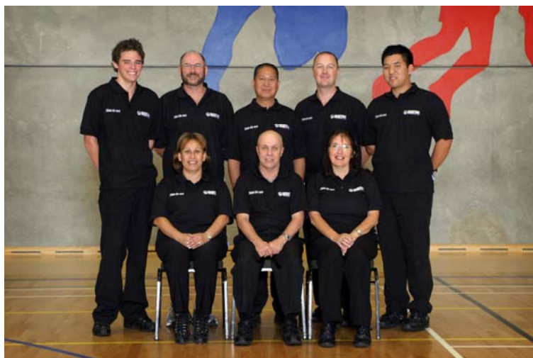
Referees at the All-NZ Camp, Palmerston North

This year is a busy year for New Zealand national basketball teams, with Olympic qualifying for the men, a pre-Olympic tournament for the women, junior Oceania qualifying tournaments and local international games. The new Technical Committee will make referee appointments to these games and tours after the AGM.